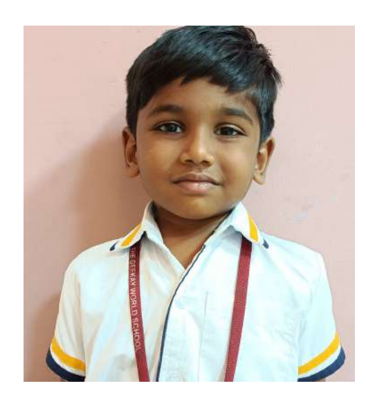
JAI KRISHH Y - K2 STRAWBERRY